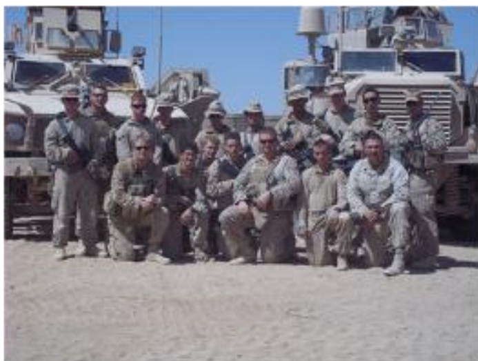
Seminole Mobile Section