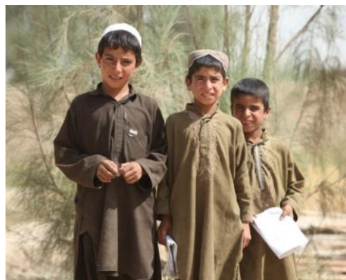
Afghan children going to school