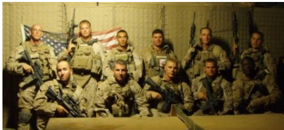
Wild Bill 2

Company’s Area of Operations and their fresh minds are a huge asset to the Company. They have done a fantastic job since their arrival and are a valuable part of the team. The First Sergeant and I are happy to have them and look forward to their continued success as part of the 2/6 team. I would like to say to the families who may be receiving this letter for the first time, we are proud to have your loved ones with us and your continued support is invaluable to their efforts. Welcome aboard!