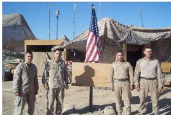
Seminole HQs (Four Horsemen)