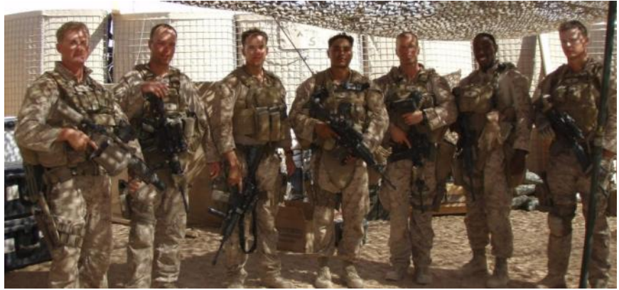
Wild Bill 3