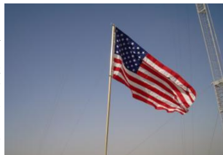
Stars and Stripes flown at COP AZADI

On November 10th, we celebrate our two hundred and thirty-fifth birthday of our Marine Corps. For some, this is one of many birthdays we have spent overseas while defending our Nation, for many in the Company it is their first birthday spent in harm's way. And I can think of no better way to celebrate our heritage and prestige then by celebrating the birthday with the men and women of this company while defending our nation, and protecting the people of Afghanistan. Today this Company continues the proud history we celebrate each year, and during future birthdays Marines will