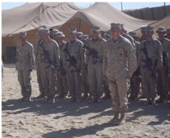
Seminole 2 (2d Platoon)