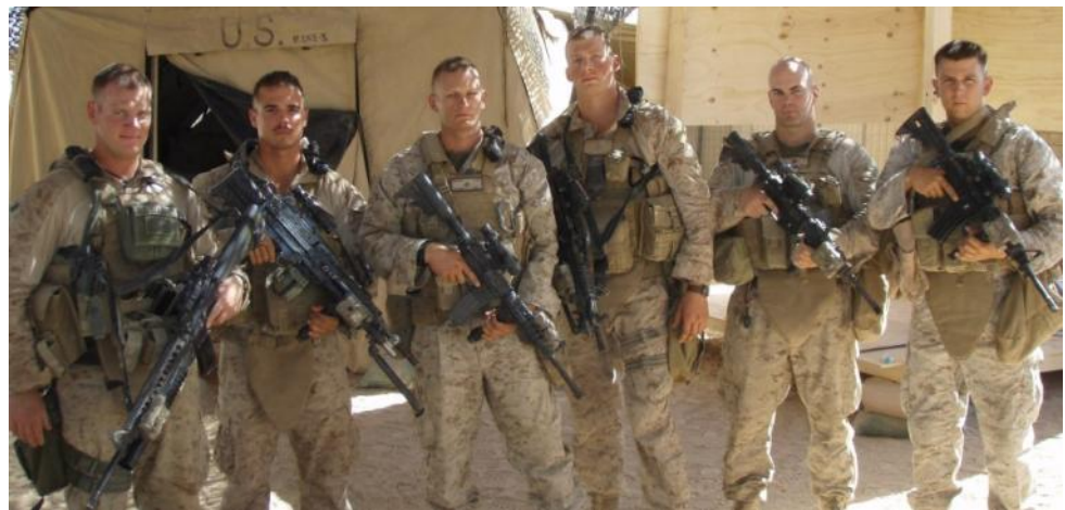
Wild Bill HQ