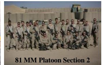
81 MM Platoon Section 2