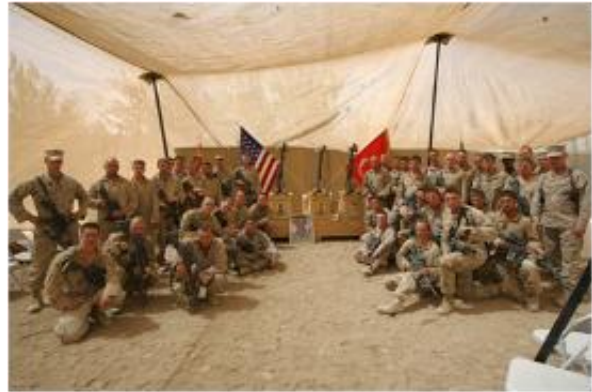
Seminole 3 (3rd Platoon)

The past month was also filled with greater interaction with the local national populace than any other month. On more and more patrols there are friendly faces, handshakes, and most important; local nationals willing to talk about the Taliban and their activities. The enemy is getting weaker, as the local nationals of Marjah are getting stronger.